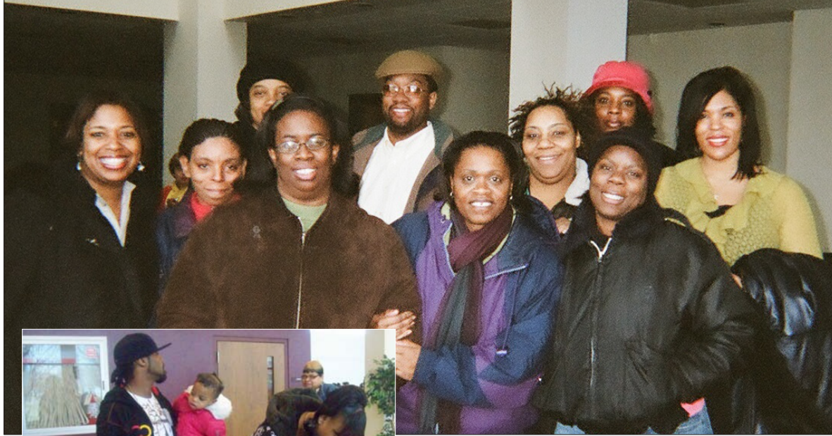
Ohio BAEO Mobilization staff with parents at Archbishop Alter H.S. in Dayton, Ohio, one of the schools visited during the school tour visits.