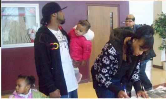
Parents look over material at the Annual Parent-School Expo in Columbus, Ohio.

The Ohio BAEO mobilization team held its 4th Annual Parent-School Expo in Columbus, Ohio. The event provided 200 Columbus area parents with the opportunity to “Shop for Education.” Participants included: charter and private schools, Supplemental Education Service (SES) providers and community organizations.